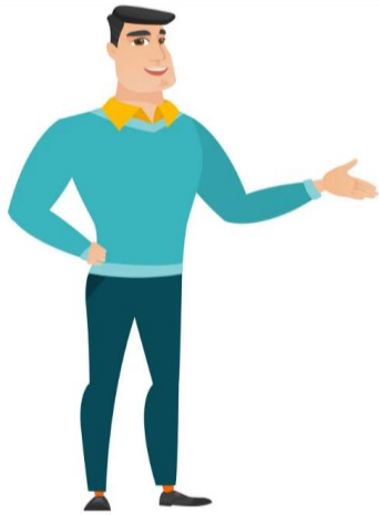
Mr. Rock Importer